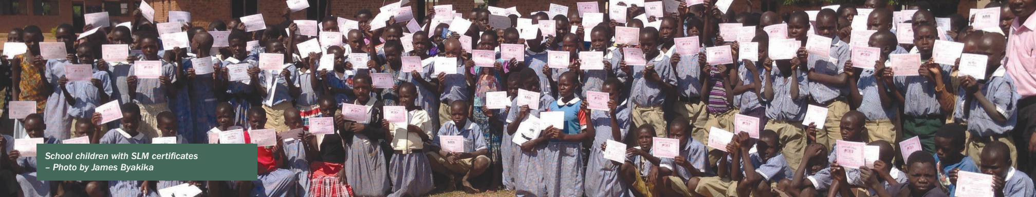
School children with SLM certificates

having the Director living at headquarters has multiple benefits—no transportation cost, on location even when things are shut down due to Covid or social unrest, accessible beyond standard business hours, etc.