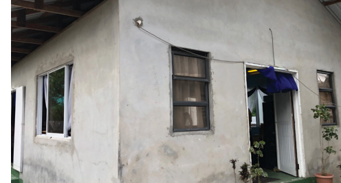
The current rented church building.