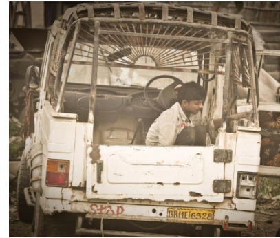
BELOW: Photo by Tory Doughty

His version was: “Every good gift and every perfect gift is from above, and cometh down from the Father of lights, with whom is no variableness, neither shadow of turning” (James 1:17).