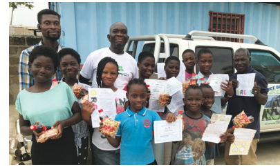
Home outreach children

But they were not idly waiting. Look at the work they were doing. They were running a school, working with rural pastors, doing COVID-19 relief, distributing Bible lessons—not only