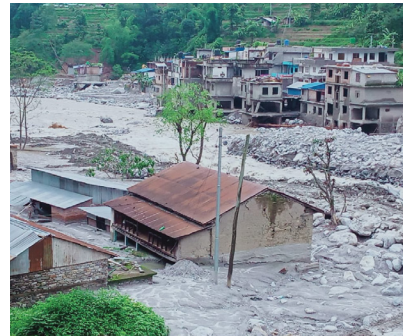
Destruction caused in Melamchi.