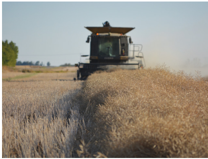
Harvesting the Crop