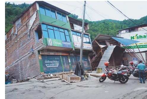
Destruction caused in Melamchi.

Everyone ran for their lives and went to higher ground. Arjun saw the muddy water pressing towards the bridge near his house and later it was totally destroyed. That whole night, no one slept. Some were crying,