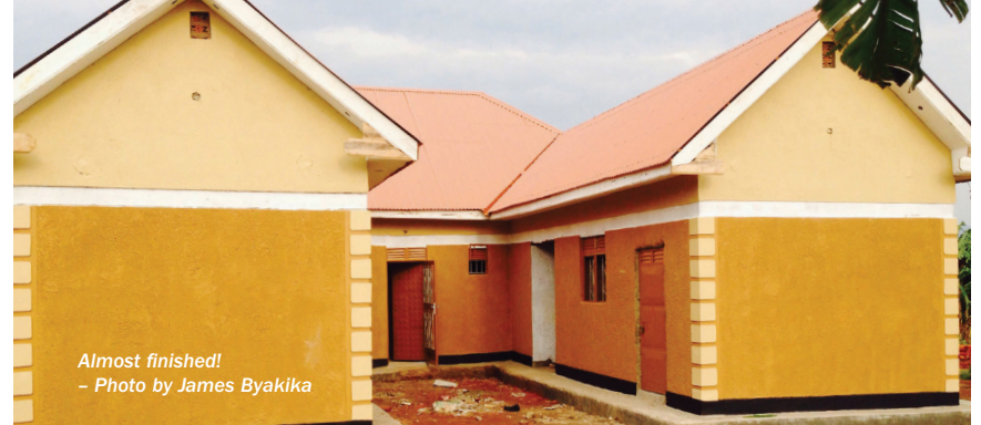
Almost finished!