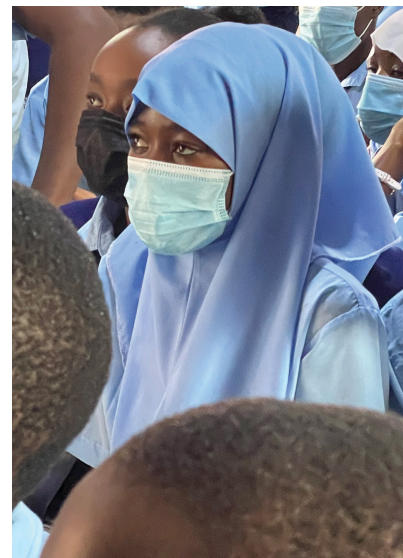
Many Muslims study the SLM courses.

In January 2021, the SLM Literature Committee began to meet and pray and seek the Lord's wisdom on all these concerns. The Lord made it clear to each of us it was time to expand into a new line of curriculum that would address each of these concerns, and it was also clear that God had begun to assemble a team that could bring it to pass. In fact, within days of this decision, God had