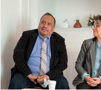
Meeting with Pastors from around Lima, Peru.

response from knocking at her door. After nearly a month they returned again, this time, to a younger man loading some boxes into a van. They inquired of this young man what happened to the lady and he said sadly that she had passed away in the night a few weeks earlier. Saddened about asking such a difficult question, they offered to help load boxes in the man's van.