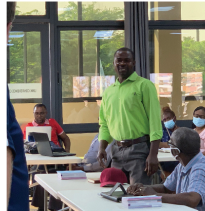
Meeting with Pastors from around Zambia.

they brought us to, for me to share the Gospel, had over four hundred high school aged students in the