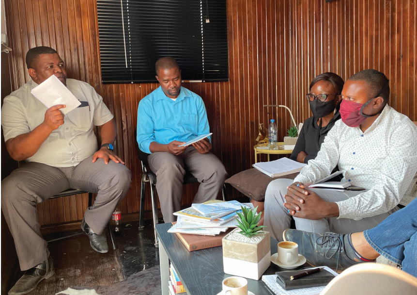
Meeting with Pastors from around Zambia.