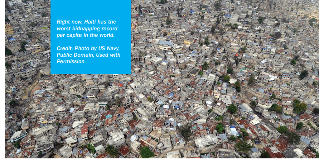
Right now, Haiti has the worst kidnapping record per capita in the world.

By partnering with nationals, we are spared when crisis occurs—spared in proximity but not in command. God says when one of the members of the Body of Christ suffers, all the members suffer with it (1 Corinthians