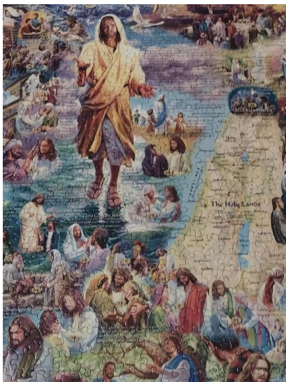
2021 Puzzle Fundraiser. We went over the Top!

in one area to serve in the ministry of Christ. Here at Headquarters, we have people gifted in administration, discipleship, printing, packing, shipping, finances, layout, graphics, and technology (to name just a few). God has put us together, as a team with our myriad of supporters behind us, so that we can “provide the tools to finish the task.” The tools that we provide are these Bible lessons, our paper missionaries that go all over the world.