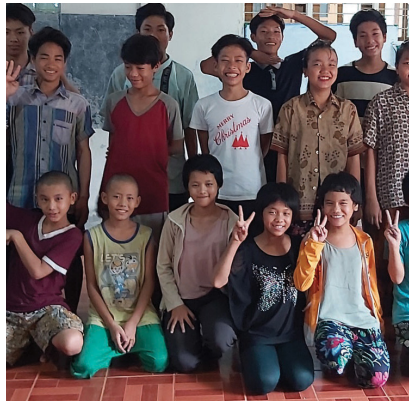
Children at the Ministry's Orphanage