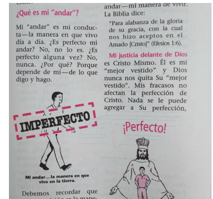
Book 6, Lesson 11, Page 9 of A Country Called Heaven in Spanish (SP:TMCI-6)

What an acute reminder that regardless of my human weakness, whether seemingly small missteps or maybe a colossal failure, my Savior is not only with me but is also strong for me. He makes up for my lack. Better yet, He not only enables my effort but also guarantees it will be successful. God is working in us both to will and to work (Philippians 2:13) and will perform what He has begun (Philippians 1:6). So, as I live for Him and try with all my spiritual imperfections, His brilliant perfection