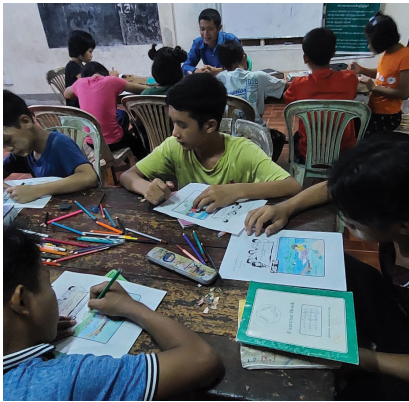
Doing Lessons at the DTB