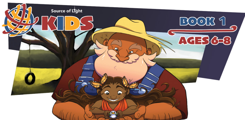
Characters for our New Children's Courses

He never stopped serving the Lord, always asking people if they were Christians. He loved the Lord and is now serving Him in Heaven after he left his earthly home December 7, 2021.