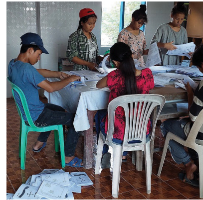
Book Binding of Lessons