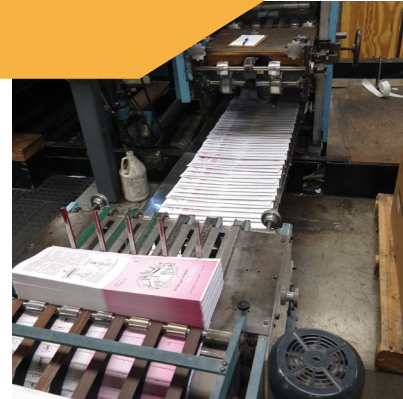
View when “Catching” Booklets Off the Big Color King Press

It was at one of these moments, near the end of the day when weariness was approaching and humanness becoming more obvious, when something ironically profound caught my attention. The booklet currently coming off was a Spanish lesson, but the English translation is easily apparent. The page facing me had near the bottom an illustration of a random man walking with the word “IMPERFECTO” written across him. That sure was the truth, and I was