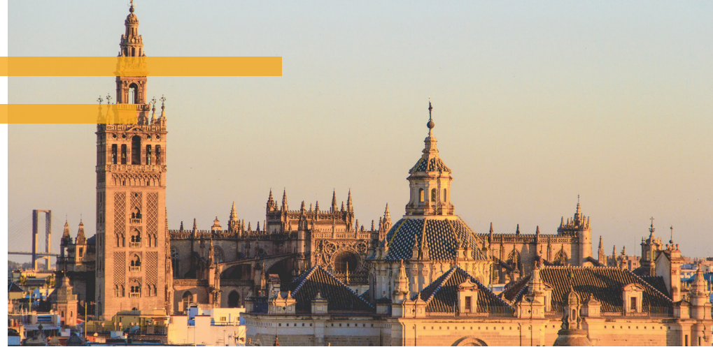
Cathedral of Saint Mary of the Sea Seville, Spain