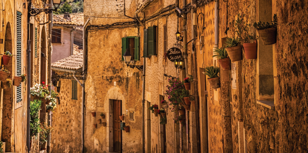
Valldemossa, Spain