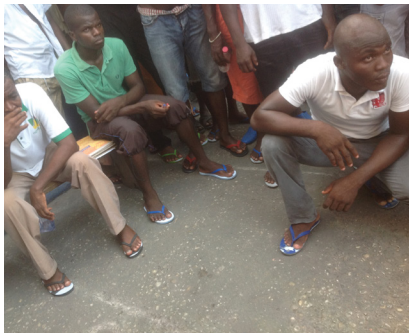
Prisoners in Africa Hearing the Gospel