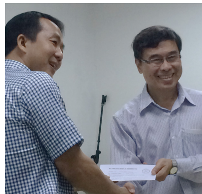
A Student Receiving a Certificate for a Course in Kachin.

Starting an institute in your church is easy, and we can train you. You do not have to be as official as an institute that offers a degree, but you can start one no matter how many students you have. The goal is to learn the Word of God, not receive a degree. Even if you only have one person who desires to study, it is well worth the investment. You can use the materials in your small group, Sunday school classes, ladies' and men's groups, college and career classes, and specifically with your church leaders. Missionaries can train other leaders with it; ministries in which you disciple others, such as an Associate Discipleship School, can broaden their discipleship and training possibilities. If you have a SLM ADS with students who finish all the adult basic courses we offer and want to continue to study, you can offer these courses to them and keep them studying.