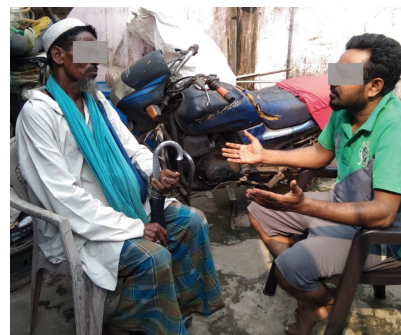
Sharing the Gospel (Notice the Clothing Differences)