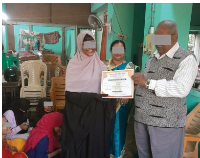
Building Relationships through the Tailoring Program

But S. had no way to follow up. They tried going to the communities, “but there was no liberty to share the Gospel with their whole house.” The women disappeared and families were not open to them. The former Imam serves in another area of the country. S. and B. are praying for a Muslim-background believing couple to come work full-time with them.