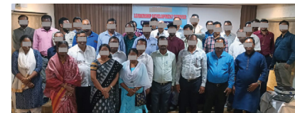
Vision-Casting Meeting for Those Interested in Working with Muslims