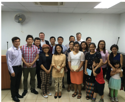
Students Taking WWBI in Kachin.

pastor came to teach him and his fellow pastors the Word of God.