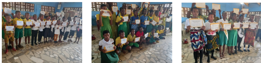
Participants upon Completing the ‘Missions & Job Training’ Program.