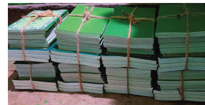
Literature Written and Designed to be Effective among Muslims