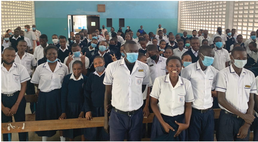
Students in Kenya Hearing the Word of God. Missionaries with SLM Regularly Go into Schools Such As This One and Are Discipling the Students As They Go through Our Bible Lessons.

our international missionaries. One of the things that God used in drawing me into missions was going on trips around the world and seeing how God was working internationally. I know that there are people in the United States who need to see what missions looks like globally, and who knows how God could use that in their own lives for His glory.