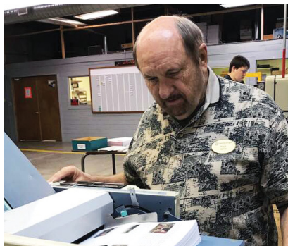
Working a Tabletop Folder in the Print Shop

Hugh made a big difference. He is missed at Source of Light.