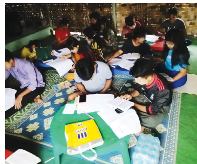
Formerly Buddhists, in July 2022 These New Believers Were Baptized and Are Now Studying WWBI Christian Growth Course.