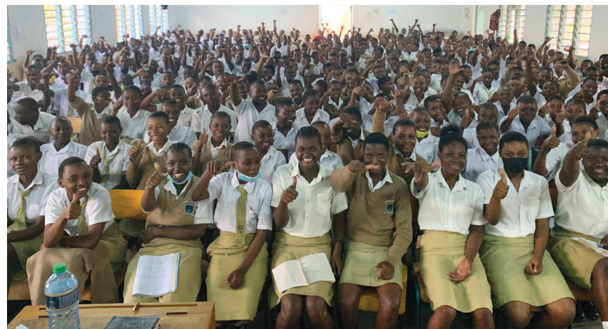
High School Students in Kenya Where SLM Missionaries Disciple the Students with the Bible Lessons.

Many of our Branches have various projects or needs for a group of people to assist with. I would love to take a youth group or college ministry from the United States to another country to serve (and to serve with)