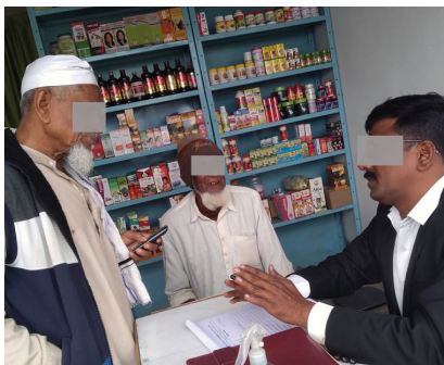
Bridge-Building through Free Medical Camp — Photo by B.

teaching on the Bible so they will know what is actually true.”