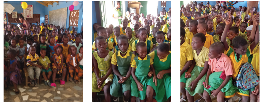
Students at the Evangelical Christian Academy in Ghana.

learning practical trades such as electrical and tailoring, they are disciplined and study Source of Light courses, such as “Exploring God’s Word” as well as “Know & Grow,” with the hope that they will go and bear fruit that will remain.