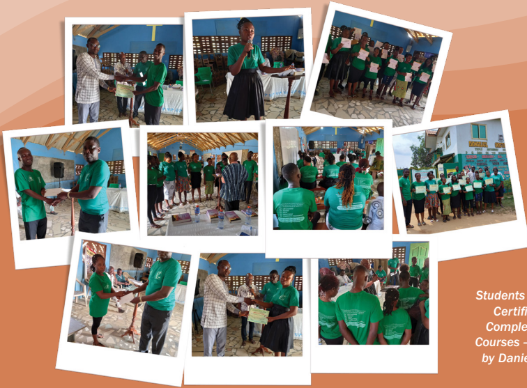
Students Awarded Certificates for Completing SLM Courses

The effect for SLM and purpose of the concept is not limited to the schools. “In addition to teaching the lessons in their classrooms, these teachers will take the training received and the lessons to the churches they are coming from. Eventually these churches will love to operate an Associate Discipleship School and start using the lessons.”