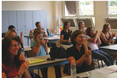
TEFL Class in Cesky Krumlov

This Reaper is filled with examples of people who have done just that. We hope their experiences intermingled with opportunities to “come along” will inspire you to join us in fulfilling the Great Commission. 🌿