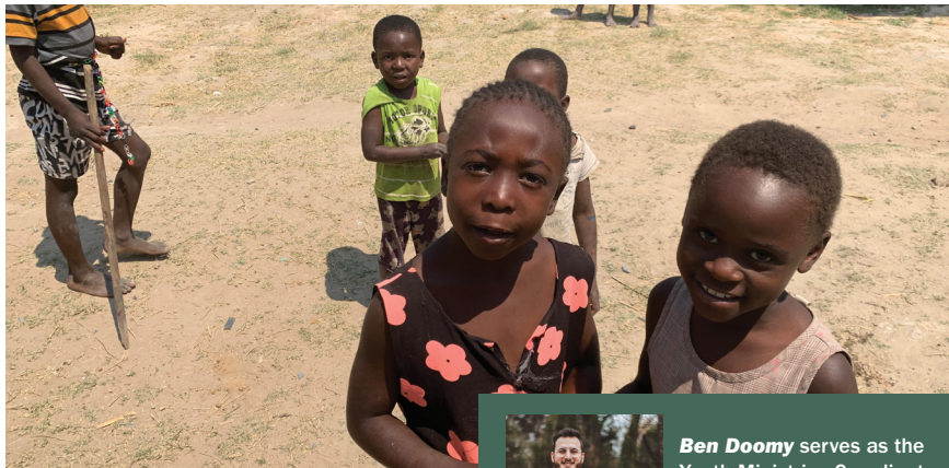
The World Needs to Hear the Gospel, Whether That's Your Neighbor Next Door or These Children in the Small Villages of Zambia

life. Some are called to preach, some are called to be missionaries, some are called to be doctors, and some are called to landscaping. Not everyone has the same calling in life, but everyone has a calling. God's will is that you would be faithful to go wherever He leads you and to serve Him wherever that is, even if it is your hometown. Romans 10:13-15 says, "For whosoever shall call upon the name of the Lord shall be saved. How then shall they call on him in whom they have not believed? and how shall they believe in him of whom they have not heard? and how shall they hear without a preacher? And how shall they preach, except they be sent?". Source of Light's main goal is discipleship around the world. That goal is being achieved by men and women who are faithful to go wherever and do whatever the Lord calls them to. Is God calling you to serve with Source of Light? We would love to serve alongside you. 🌿