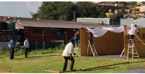
Setting Up the Life-Size Tabernacle