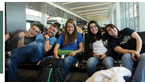
Part of the University Team in the Airport Ready to Go