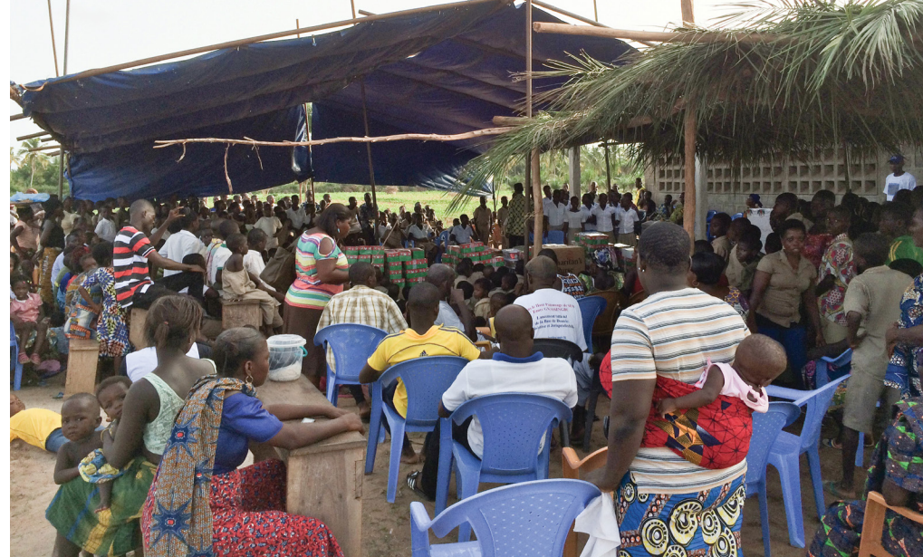
The View As We Arrived