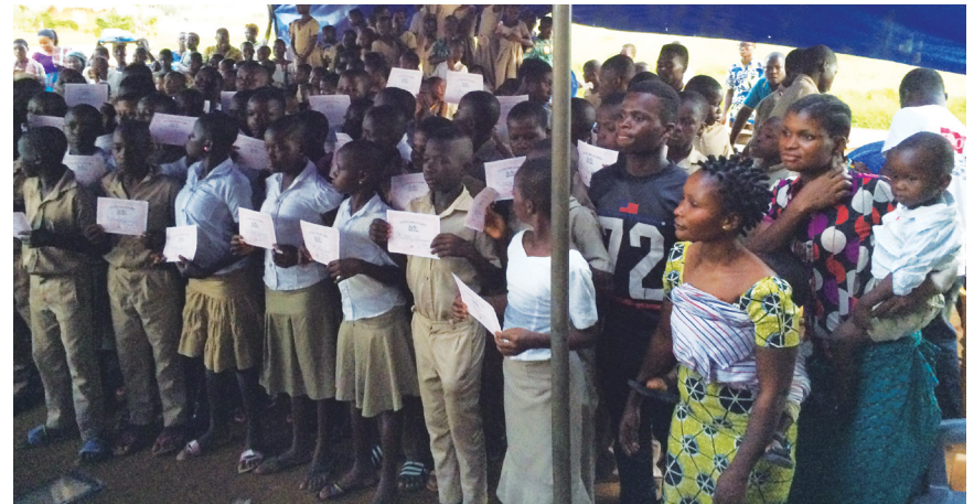
Students Receiving Completion Certificates

The next message I received was that when he got back from his hospital checkup, he planned to go purchase a van that would help him reach even more remote villages with his team of church planters and evangelists with the money so graciously provided by a US foundation. Then he would like to talk more about a church planting and pastors conference he would like me to speak at when