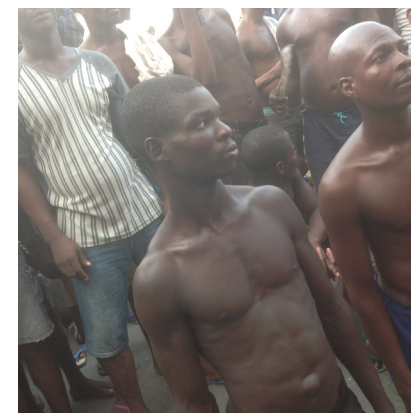
Preaching to a Packed Crowd

But within days he began to experience setback after setback. He initially had some pain in his finger and hand, which a local hospital attempted to treat, but the pain and infection grew so severe, he went to a