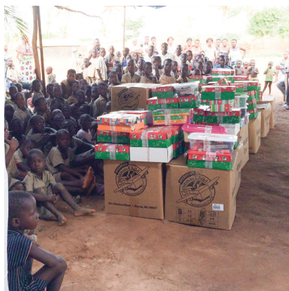
OCC Shoeboxes Being Handed Out

A couple of them told me of what they considered to be the hardest place to reach, a place that I'll call "Fio" for safety reasons. It seemed like in between every few stories,