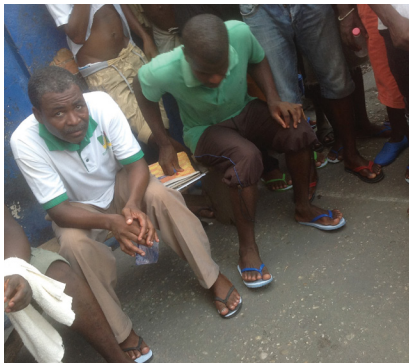
Prisoners Listening Intently

mission hospital many hours away to seek better treatment.