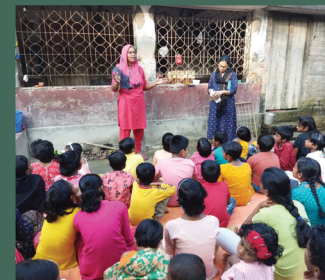
Ladies Teaching the Children at Bishnupur and Joka