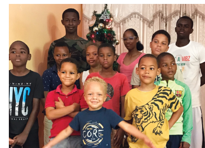
Some of the Young People at Christmas in Western Jamaica

fleeting and are only as useful as they help us carry the Gospel, "that the excellency of the power may be of God, and not of us" (v. 7b). But what is "this treasure"? What are we carrying? "For we preach not ourselves, but Christ Jesus the Lord; and ourselves your servants for Jesus' sake" (v. 5). We are only obedient messengers, and the focus of our message is Jesus. Why do we do this? "For God, who commanded the light to shine out of darkness, hath shined in our hearts, to give the light of the knowledge of the glory of God in the face of Jesus Christ." (v. 6). We have seen the Light, so we must share the Light! From a human perspective, there may not be anything greater than seeing a child's face light up about Christmas. But what would be a greater hope and dream this Christmas? An island where another child receives the greatest gift of Jesus Christ. 🌿