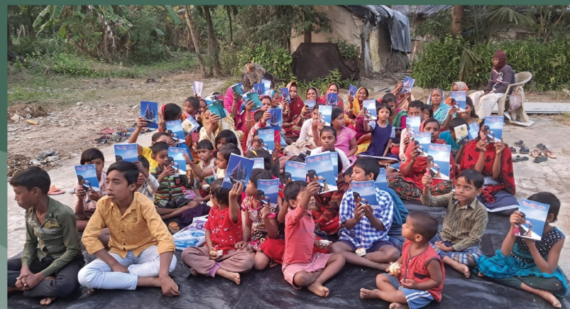
Children Holding Up the Literature They Received