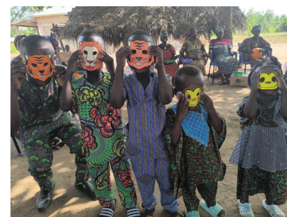
Orphan's Playing at Our Christmas Outreach

The two events alone at Christmas give more opportunities to bring people to Christ than most other days of the year combined. Christmas for SLM Togo will always be the time “to shine our light.” 🌿