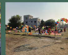
Large Group of Children with Colorful Decorations in Barulpur