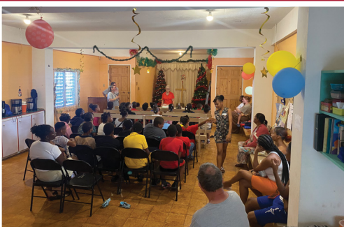
Enjoying the Christmas Party at Follow the Source, Jamaica

confusion that surrounds the real meaning of Christmas. The event is for students of the Bible club they hold every week, but the kids invite anyone all around the neighborhood. And praise God, they often see attendance increase going into January. This is one of the goals, to cultivate the regular study of God's Word, not only as a worthwhile activity of life but much more as the regular pattern and vital sustenance of a follower of Christ.