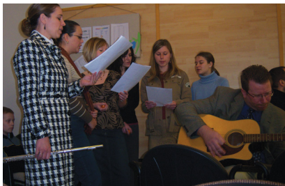
Christmas Eve Carols

Matthew 5:16 reminds us to radiate Christ to a lost and dying world, and perhaps there is not a better, more appropriate, nor opportune time to do it than this Christmas season. My challenge to you and to me is this: let's not let this moment, this opportunity, pass us by. Seek out the opportunities in your life to "let your light shine"!