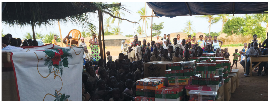
OCC Shoeboxes Kept the Crowd

I was informed our last event of the day was to be an open-air message they would like me to bring ... if people were still at the venue. We were behind schedule, way behind almost two hours, but with bad roads from recent rains the delay was unavoidable.