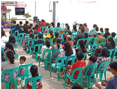
Choir Singing in and Audience Listening to Christmas Program

At the age of 12 years old, right after my mother passed on, a classmate tried comforting me by introducing me to a school program by Youth for Christ. I was then invited to his church, introduced to a female youth leader, and the Gospel was shared with me. There and then I accepted Jesus Christ as my Lord and Savior. Being the only daughter left in the house, even at this tender age, I had to shoulder a lot of responsibilities in the family. To attend church each Sunday created a lot of challenges to me, but God is good, and He enabled me mightily.