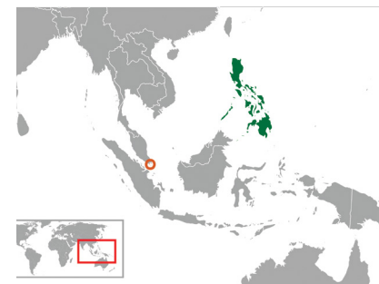
Singapore Circled in Orange. Roughly the Size of Atlanta. Philippine Islands in Green