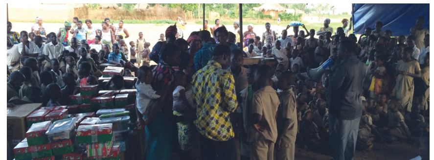
OCC Shoeboxes Being Handed Out

On numerous occasions, these evangelists had visited Fio, and within a short amount of time, they were driven out with threats on their life. Undeterred, they