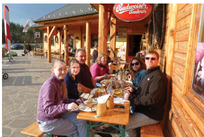
Christmas Eve Meal with Church Friends

This Reaper is filled with stories of Source of Light missionaries and ministries that open the door for the Gospel and reach out to the very ends of the earth. Imagine this Christmas that many will finally understand the Christ of Christmas. We hope you will enjoy the Winter Edition of the Reaper , but we also sincerely hope you will join us in shining His light this Christmas season.