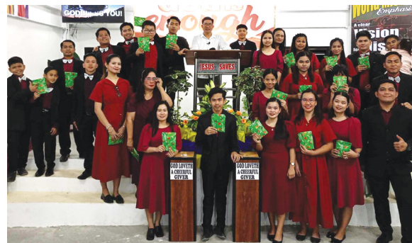
Choir in Philippines Serving the Church and Celebrating Christmas