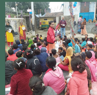
Stars, Balloons, and Booklets at Christmas in Kolkata