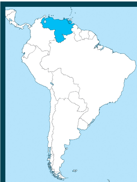
Venezuela Borders Brazil, Colombia, and Guyana in South America

We discussed providing him with electronic copies to print in country and other options about potentially smuggling printed lessons in through