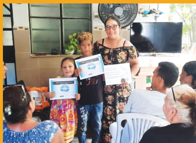
Course Completion Certificates Earned by Adult and Child Students

According to Open Doors, “The island’s government is the main reason Christians face persecution. Anything deemed to be in competition with the Communist Party of the island is squeezed, and this includes the Christian faith. Church leaders or believers who speak out against human injustice or political corruption—or who dare to criticize the regime—risk interrogation, arrest, smear campaigns, and even prison sentences.