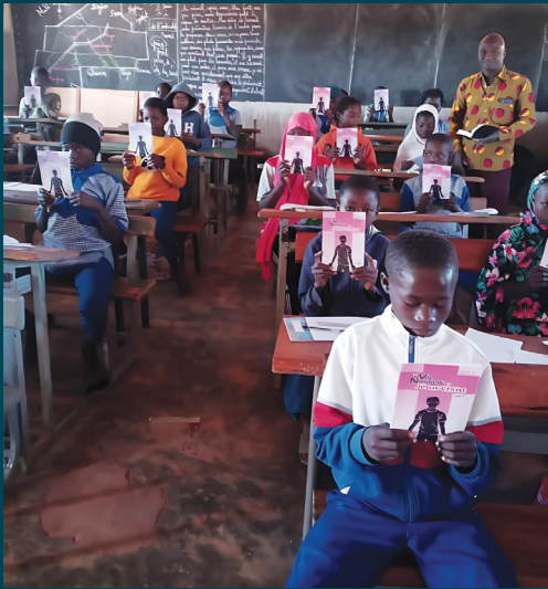
School Children in Burkina Faso with SLM Bible Lessons