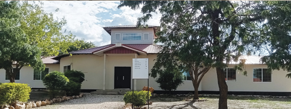
Main Campus of Ambassador International University