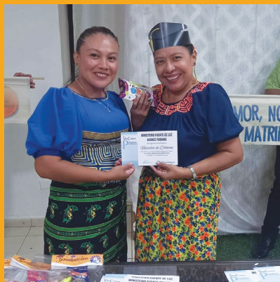
Joyful Disciples in Panama