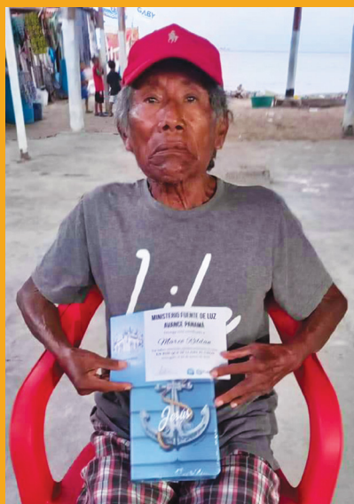
So Many Need the Good News