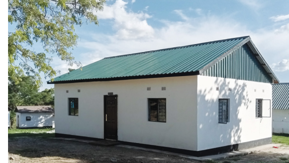
Newly Constructed SLM Print Shop in Zambia

students, who represent several African nations including Zambia, Malawi, Mozambique, Togo, and Zimbabwe. Along with studying the courses themselves, the students participate in practical outreach trips where they disciple others in the surrounding villages using Source of Light lessons. This concept comes from Kelvin's vision and carefully calculated plan to equip students with the tools they need to start their own Source of Light Associate Discipleship Schools or possibly even Branches when they graduate and return to their respective countries. They are doing the work now, so they