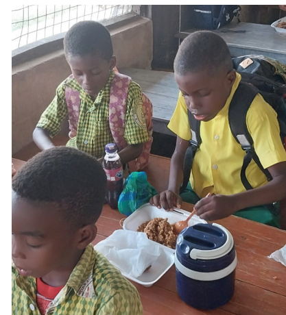
Students of Evangelical Christian Academy in Ghana