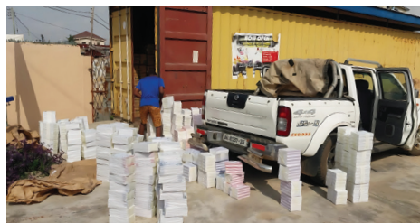
Lessons Printed in Ghana Being Packed in Container at Office

The staff faithfully serves in the work they have been given, and they are not forgetful to pray together for God's blessing and provision. They have seen Him supply their needs, and the ministry still continues to grow. As with any healthy organization, hard work