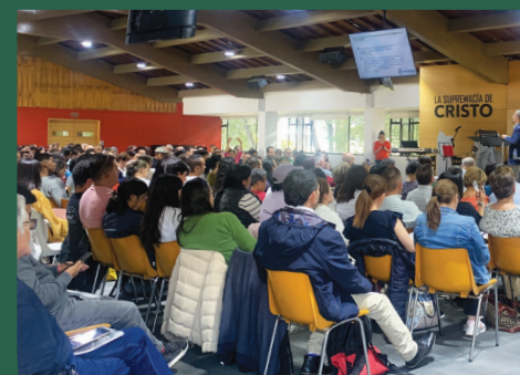
Bible Conference Students at the Annual Congress