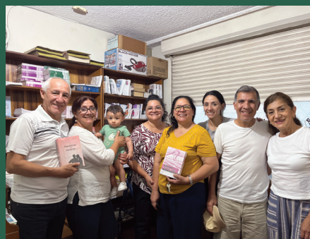
Our Team Visiting the SLM office in Bucaramanga

The desire to expand is not just limited to their own borders. “We are praying for a pastor friend of ours in Ecuador who wants to have the SLM materials, and we were able to provide him with some. And also in these days, the Lord has given us another challenge: to help a brother who wants to start working with SLM in Venezuela. The challenge is immense since the entrance of Christian material to that country is restricted. But the need there and the opportunities are great in the midst of the crisis faced by the population due to lack of resources and the fear of police persecution. We are willing to send material to the border and coordinate the passage, counting on the Lord’s help. We are waiting