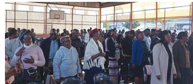
Attendees for the Conference in Mozambique