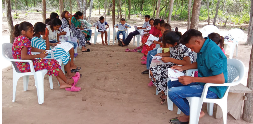
Children from Communities Studying the Bible Together

ways as well as providing resources for the administration, promotion, and distribution of the materials. To this day, we have managed to have 46 Associate Discipleship Schools and expand our coverage to 12 states (out of 32) of our country. It has been exciting to see our beloved God working before us.”