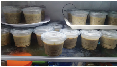
Green Bean Porridge for Sale

mushrooms in a large, dark, damp room to sell. He raised catfish in tiny ponds and sold them in the market.