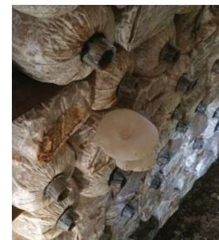
Left to Right: Curios Sold to Tourists Helped Pay Ministry Costs, Growing Fish to Fish for Men, Mushrooms Grown in the Dark Helped Provide for Those Carrying the Light