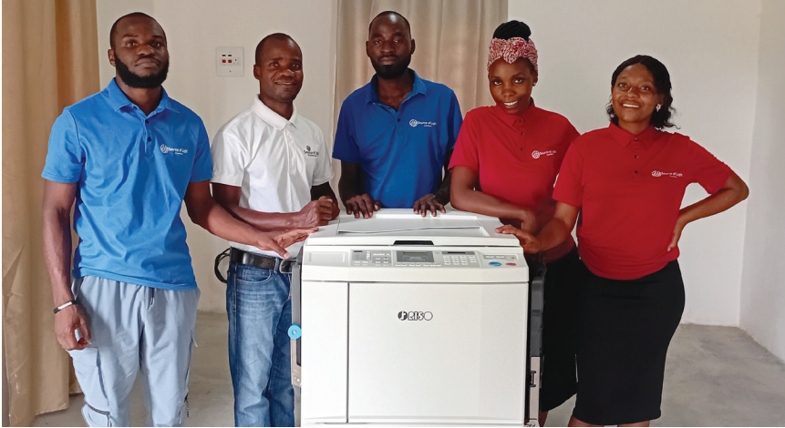
SLM Zambia with Their New Duplicator

for, I was seriously concerned. But he wasn't, and God provided! Oh, me of little faith! In fact, it was one of the best conferences I have ever been a part of, and the attendees asked when the next one was. Stewards!