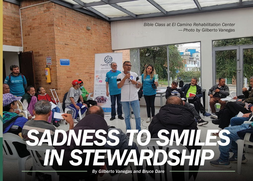
Bible Class at El Camino Rehabilitation Center

Would you prayerfully consider partnering with SLM through the Global Outreach Fund?