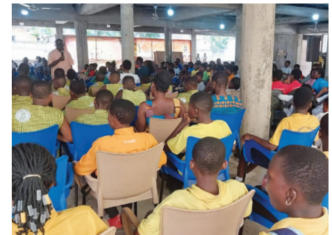
Student Rally Led by Ghana Discipleship Training Branch

for all that lies ahead. Here at home and all the way in Ghana, we wait on the Lord, and we put into practice consistent acts of obedience. He is already working to accomplish His plan, spreading the Gospel through great and simple ways and calling laborers to serve in the work He is doing. We each are privileged to have a part in His work. He is faithful. He has done the work already, and He will continue to do it. In this hope, we can carry on. 🌿