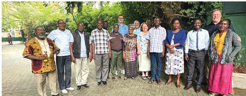
Participants of Africa Regional Conference in Kenya

Faithful Christ-followers in Ivory Coast knew that they had an obligation to care for those in need. Source of Light missionaries saw the obvious need for spiritual growth as their hearts were burdened for the lost. Everyone was created with an innate desire for God, but many look elsewhere to fill this need. Many villages all over Africa turn to witchcraft as a means to feed their spiritual needs. Thankfully, there are men and women who know the only way to satisfy this desire is with the Gospel of Jesus Christ. While reaching the lost with the Gospel, there became an evident need in Ivory Coast for an orphanage.