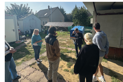
The Compound of Containers Used for Ukrainian Refugees