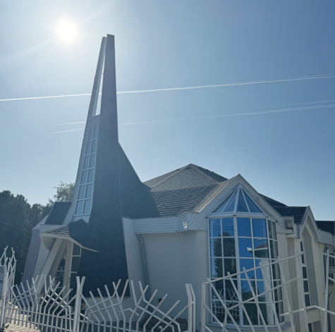
Erd Baptist Church