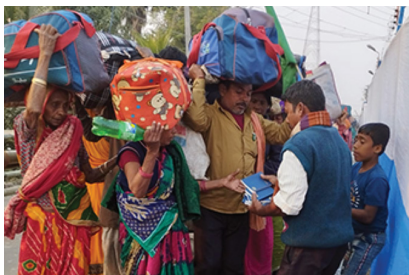
Giving Bibles to Thousands on Pilgrimage, Hoping to Wash Their Sins Away