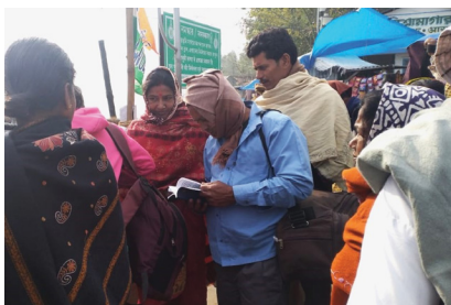
“Let us show His Word since a door is opened; we cannot work when the door is closed. The Word of God will save the lost souls.”

The door is open right now, and God has prepared His people and equipped them for such a time as this. Pilgrims seeking to be washed of their sins will not find cleansing in a filthy river, but they might find it from going there, thanks to a group of courageous and faithful believers willing to pray, fast, distribute, and be imprisoned or worse, so a group of weary pilgrims may encounter Jesus Christ, the true and only Crossing Point between Heaven and Earth. 🌸