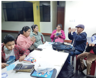
Deaf Students During the Class at the Associate Discipleship School

If effective, the process could be replicated in other original languages,