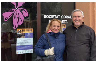
Gateway to Centelles

It’s our hope and prayer that the stories contained in this edition of the Reaper will inspire you to participate with Source of Light International or someplace nearby in what God brings your way that you in particular are specially equipped to do, “for such a time as this.” 🌿