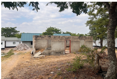
Future Home of SLM Zambia