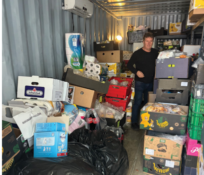
One of the Containers Where Food Was Stored

And finally, pray for the continued effectiveness of the SLM “Paper Missionaries.” whether in print or