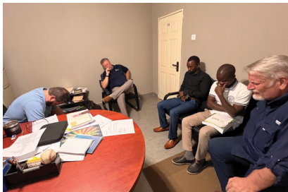
Time of Prayer With AIU Staff

The students of AIU have come from around Zambia and are a part of the vast network of churches partnered with Gospelink. Eventually we will work with Gospelink and this network of churches (and beyond) to train these pastors and church planters to effectively evangelize and disciple their communities and