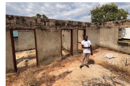
Dreaming of an Office Here One Day — Photo by Ben Doomy

Within a few months, we found a few candidates who were recommended to