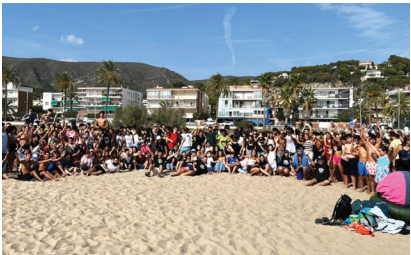
Youth Outreach — Photo by Paulina Vecchiarelli

The Vecchiarellis are part of the Global