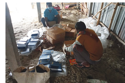
Assembling Materials

In another location, the monks themselves helped protect them from opposition, saying, "These books are very good."