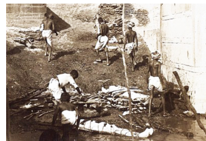
This 1903 Image States, "Who Dies in the Waters of the Ganges Obtains Heaven."