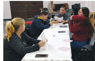
SLM Discipleship School in Spain