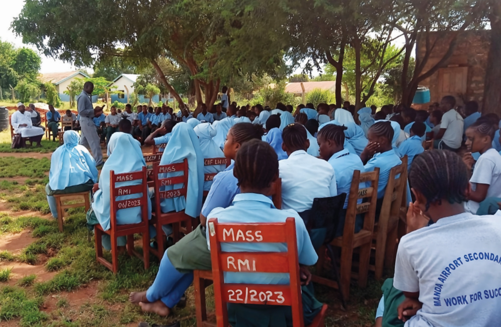
The Gospel Being Shared at a Secondary School in a Largely Islamic Region of Kenya.