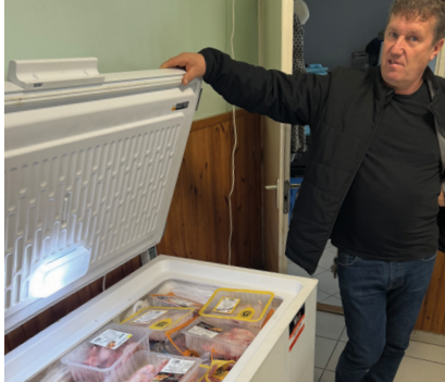
Freezer Containing Donations to Address Community Needs

afforded to a ministry like I have seen at Source of Light. At times, I have to ask God, “Do I need to ‘bring in the reins’ on these opportunities?”