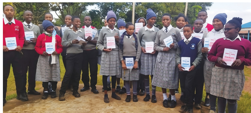
Students in a New School That Was Established by a Staff Member in the Central Province.

At times, the work is rewarding and exciting when God works in unexpected and spectacular ways. Such a story