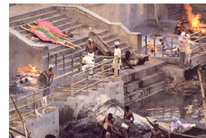
The Practice of Cremating Hindus and Pouring Their Ashes in the Ganges Continues Today.

Unlike cultures flooded with literature to the point of ignoring or tossing material offered by strangers, these people, K.